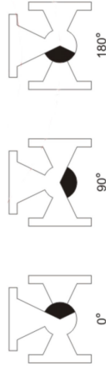
◆ Diagram 3